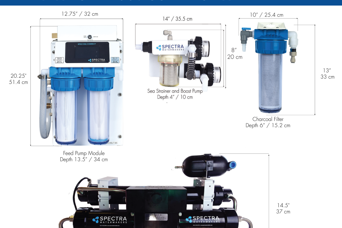
27" / 69 cm High Pressure Clark Pump and Membrane Depth 12" / 30.5 cm