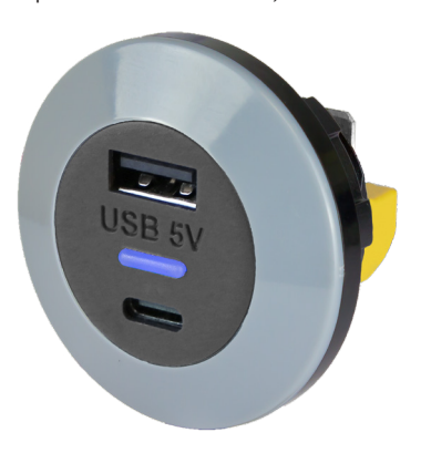
The PV65R-ACFf offers both A & C outputs, Front fitting bezel ring and IP protection to IP65

Standard versions require only 20mm (typical) rear space and can easily be installed in bus and coach seat backs, walls and dashboards. A series of installation pod designs enable retrofit options for underseat, table and wall mounting.