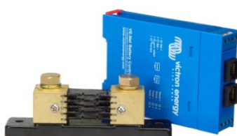
VE.Net Battery Controller