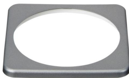
BMV bezel square