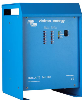
Skylla TG 24 100