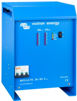
Skylla TG 24 50 3 phase

To learn more about batteries and charging batteries, please refer to our book 'Energy Unlimited' (available free of charge from Victron Energy and downloadable from www.victronenergy.com ).